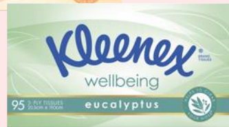
Kleenex Wellbeing Aloe Vera & Vitamin E Or Eucalyptus Tissues 95 Pack